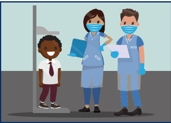
The nurse asks me to stand next to a big ruler so she can see how tall I am.