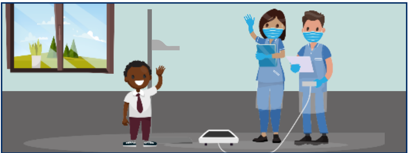
The nurse writes it all down and that's it, back to class now!