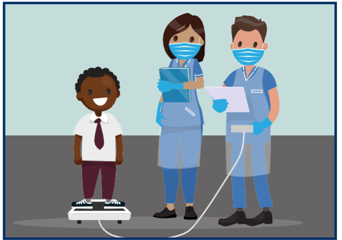
I stand on a little platform that tells the nurse how much I weigh.