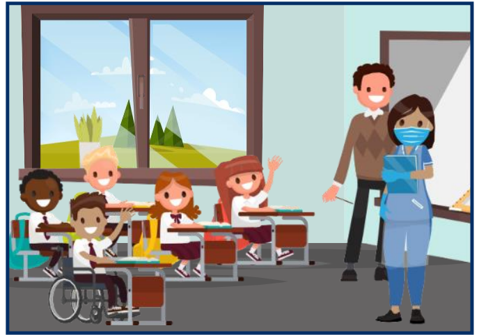
I go to see the nurse and she says hello.