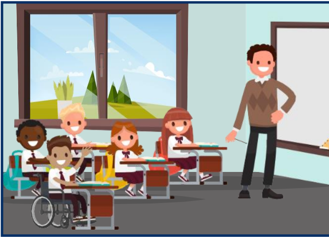
Today the school nurse is going to check how I'm growing and staying healthy.